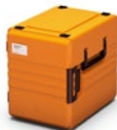
Thermoport 1000 K