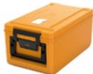
Thermoport 100 K