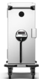
Thermoport stainless steel