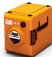
Thermoport 1000 KB